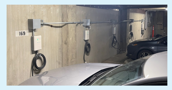
Figure 1. Ten chargers (Level 2) installed at above property for <$3,000 per charger

Overall, EV Ready projects cost about $4,000 per installed EV charger. This is significantly lower than other programs in California, which typically range in cost from $10,000 to $18,000 per installed charger.