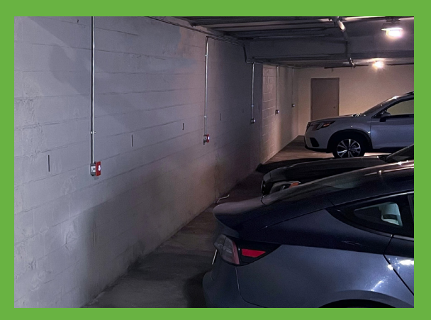
Figure 3. Level 1 chargers installed at Tyrone Properties